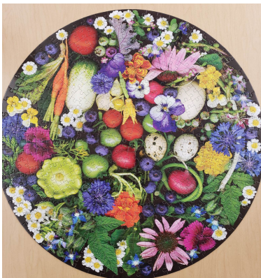
A springy puzzle.

Connect with other Francophiles over drinks and snacks. Practice your French speaking skills, or sit back and practice listening. All skill levels are welcome. The library will buy one round of hors d'oeuvres; drinks and other food are on you.